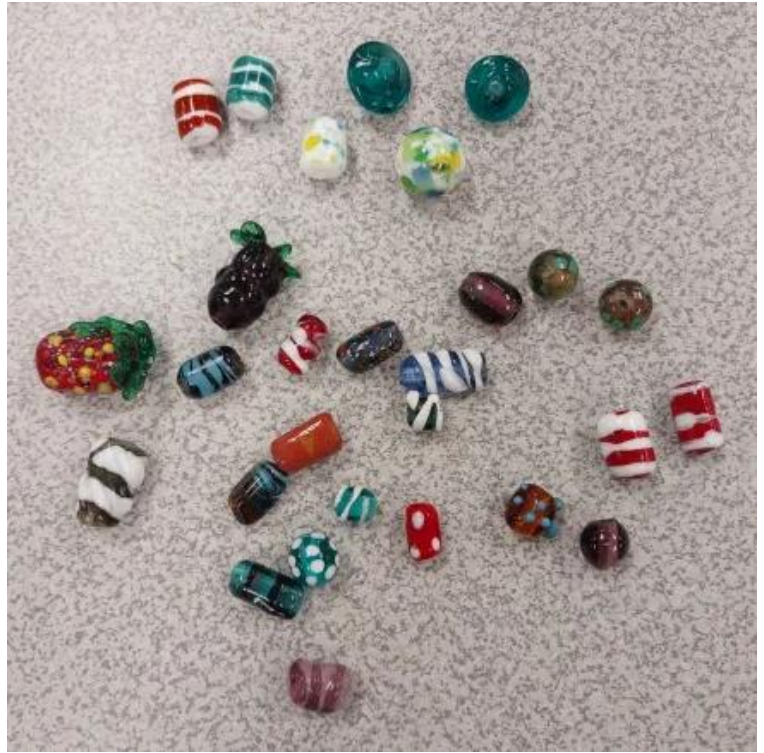
Student work from the bead class with Master Sigulf