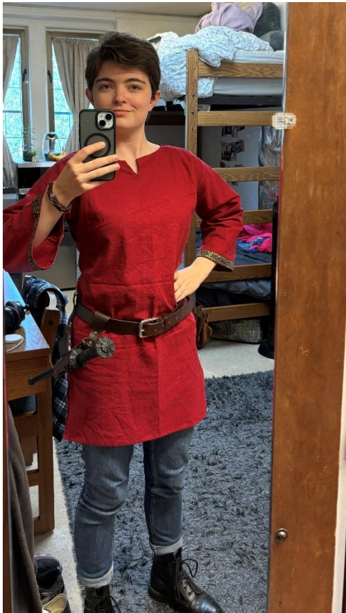
Perrine's T-Tunic from a sewing weekend