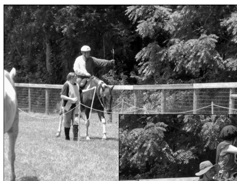
Mounted archery practice and instruction at the Middle Kingdom Equestrian Symposium.

and preparing a horse to play SCA games as well as mounted combat as it relates to the SCA. Along with the classes, games and equipment were set up to play Saracen heads, ring-tilt, reeds, pig-sticking, quintain and birjas as well as an exciting challenge course. A couple of nice long trail rides